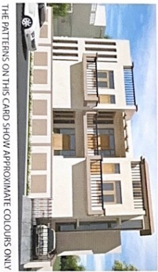
THE PATTERNS ON THIS CARD SHOW APPROXIMATE COLOURS ONLY