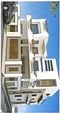
ALSO AVAILABLE IN WHITE 1951 & BLACK